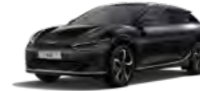
Aurora Black Pearl (ABP)