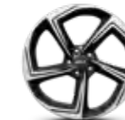
EV6 GT - 21" Alloy Wheels