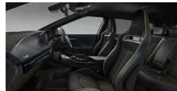
EV6 GT - Black Suede Bucket Seats with Neon Green Stitching