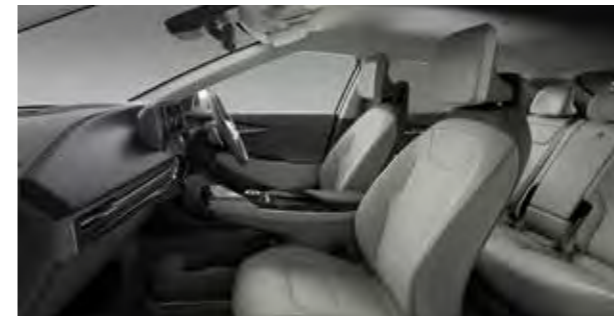
EV6 Earth - Charcoal Grey Vegan Leather