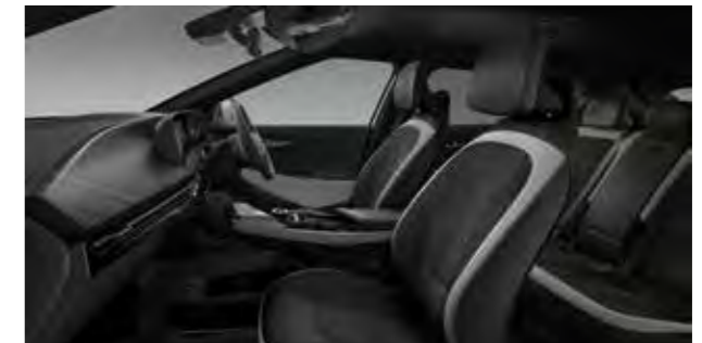
EV6 GT-line S - Black Suede & White Vegan Leather