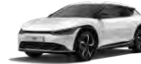
Snow White Pearl (SWP)