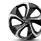
EV6 GT-Line S - 20" Alloy Wheels