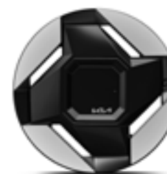
Earth - 19" Alloy Wheel