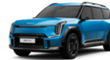
Ocean Blue GT-line 6/7 Seat