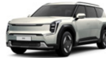
Ivory Silver Earth