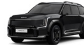
Aurora Black Pearl Earth, GT-line 7 Seat