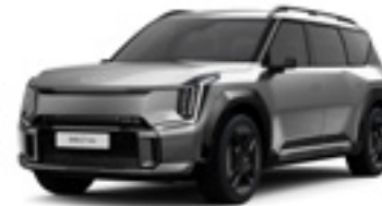
Pebble Grey Earth, GT-line 6/7 Seat