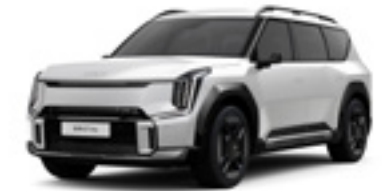
Snow White Pearl Earth, GT-line 7 Seat