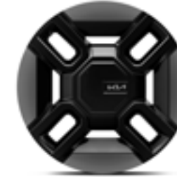
GT-line - 21" Alloy Wheel