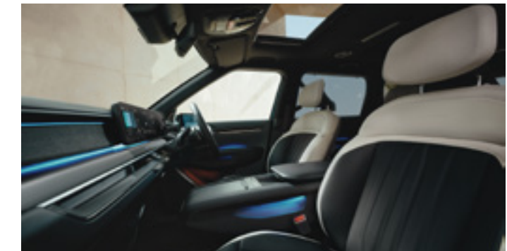
GT-line - Two-tone Vegan Leather