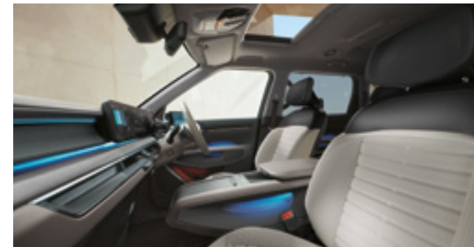
Earth - Two-tone Vegan Leather