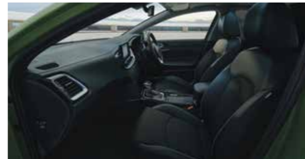
PHEV - Black Cloth & Artificial Leather Seats with Blue Stitching