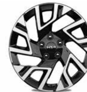
PHEV - 18" alloy