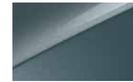
Yuka Steel Grey