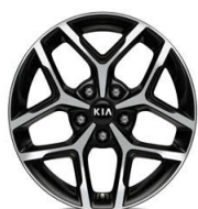
GT-line - 17" alloy